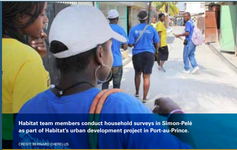
Habitat team members conduct household surveys in Simon-Pelé as part of Habitat's urban development project in Port-au-Prince.

Habitat's core house is approximately 26 square meters (280 square feet), including a covered front porch. The house is designed to be culturally appropriate and disaster-resistant. Walls are plywood and concrete, with a concrete floor and corrugated metal roof. The foundation of each house includes buttresses that can support the addition of another room on the back. Each homeowner family receives construction training and assistance from a Habitat Resource Center in the expansion process.